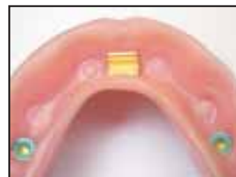
Final Denture with Attachments

Step 3: Seat the final overdenture and follow conventional procedures for the delivery of the final restoration.