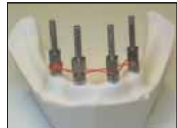
Fixed Detachable Impression Posts

If the Fixed Detachable Abutments were placed, use the Fixed Detachable open tray Impression Post and long screws for the fabrication of a verification jig as shown or use Temporary Abutments as described in Step 4.