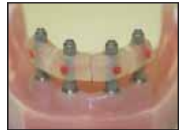
Sectioned Jig Placed in the Mouth