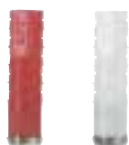
UCLA Abutment System

In most cases, the patient perceives no esthetic difference between an implant attachment retained overdenture and a bar attachment retained overdenture. However, the patient can expect a more stable (less movement) and more expensive prosthesis with a bar attachment retained overdenture. The chairside protocols for bar attachment retained overdentures, using different attachment mechanisms (i.e. O-Rings, ERA Attachments, Ball Attachments, etc.) are virtually the same. The primary differences between these attachment mechanisms include: required interarch vertical space, angle correction capabilities, amount of retention they provide, and biomechanical advantages and disadvantages. There are three common abutment systems available for a bar attachment retained overdenture: the UCLA Abutment, Fixed Detachable Abutment and the Standard Abutment Systems (also known as transmucosal abutments).