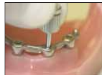
Third Coping Screw Placed

Step 4: Continue placing the Abutment Screws around the arch. Verify the fit each time you place a screw.