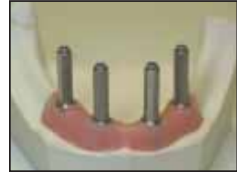
Temporary Abutments Placed

Step 3: Place the Temporary Abutments onto the master model and hand tighten using the long screws.