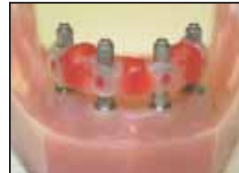
Completed Verification Jig

Once the clinician has established a passive fit with the verification jig, the master model may need to be altered to the new relationship before the bar framework can be fabricated. Remove the soft tissue from the master model. Using a straight bur, remove the misaligned analog(s) from the master model. Attach the implant analog(s) to the verification jig. Soak the master model in water and then carefully vibrate stone into the voids around the flats of the implant analogs.