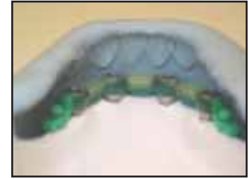
Waxed Bar Pattern

There are many different types of attachment mechanisms in various heights and diameters. Choose an attachment mechanism that will provide adequate thickness for the acrylic and enough room for the denture teeth.