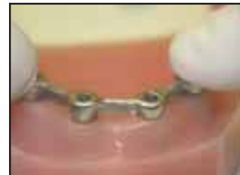
Bar Framework Seated

Step 2: Confirm that the bar framework seats passively.