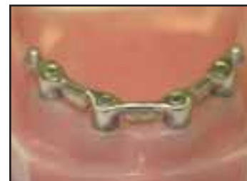
Bar Completely Seated

Step 5: Once the bar framework is completely seated, follow the normal procedures for wax set-up evaluation.