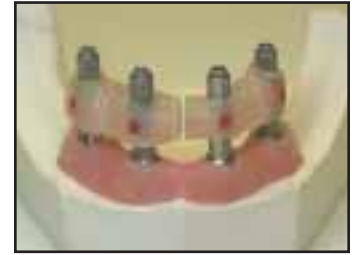
Facial Dots for Orientation

Step 5: Replace the Healing Abutments and return the verification jig to the dental laboratory.