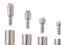
Standard Abutment System