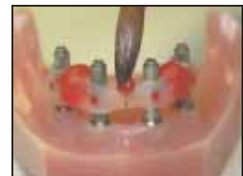
Luting of Sections