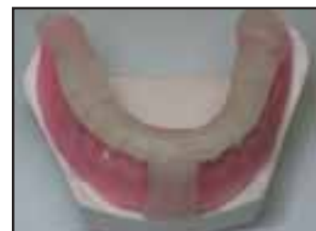
Matrix on Model

Step 1: Index the facial contours of the approved wax set-up with a putty or plaster matrix. This will provide a guide for bar positioning and attachment placement.