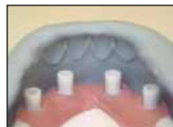
Sleeves Cut Down

Step 2: Remove the matrix and the wax set-up from the master model. With an abutment screw and the UCLA Gold/Plastic Combo Sleeves (Non-Locking), secure the sleeves onto the implant analogs and hand tighten. Reduce the occlusal height of the sleeves to fit within the matrix of the denture set-up.