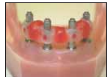
Completed Verification Jig