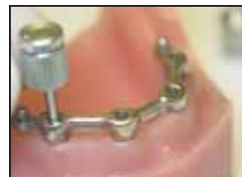
First Coping Screw Placed

Step 3: Beginning with the most distal abutment/implant, place the first Abutment Screw. Hand tighten the Abutment Screw. Make sure the abutment interface/connections on all the remaining implants are completely seated.