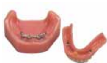
Bar Attachment Retained Overdenture

When the tissue depth exceeds 3mm, a transmucosal abutment is recommended to extend the seating platform of the metal framework to the abutment approximately 1.0mm to 1.5mm above the tissue height. This will allow better access for hygiene care. It is highly recommended that a full diagnostic set-up be completed prior to fabrication of any overdenture restoration. Typically, fabricating a new denture for the patient is required due to the limited ability to retrofit an existing denture to a metal bar.